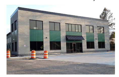
Ada Valley Meat Co. - 6210 Fulton

office addition along with renovations to existing office space for a complex of over 22,000 sq. ft. Ada Valley began operations at this location in 1987 and employs over 30 people. Thank you, Ada Valley, for calling Ada Township home.