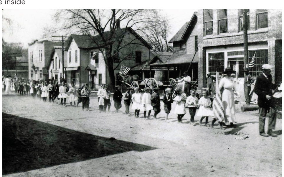
I love a parade! Ada children march down Ada Drive in honor of Memorial Day (Decoration Day) about 1915.