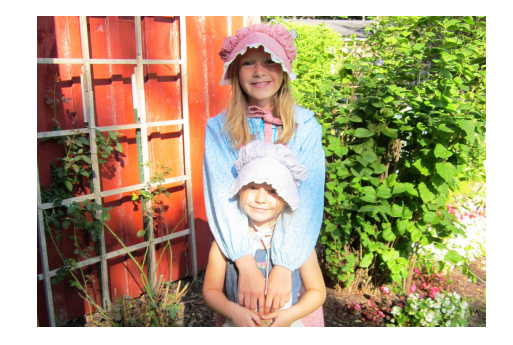
Pioneer Day August 3 9:00am-12:00pm Ada History Center Museum

Immerse yourself in historic Ada! Experience life as a child in the 1800s through exploring in the museum, playing games and crafts.