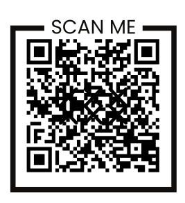
FOR ADDITIONAL INFO & PRICING