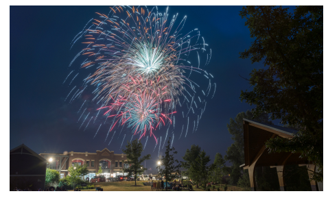
4th Of July Celebration

Saturday, May 13 at Ada Park, 5:00pm Presented by the Ada Historical Society. A free event to celebrate the history of baseball in Ada. Lawn chairs and blankets welcome.