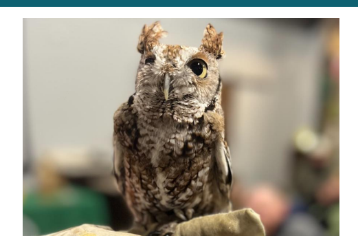
Michigan Wildlife Day July 27, 9:00am-12:00pm Roselle Park

Learn about local wildlife, see live animals, play fun games, explore wildlife habitats and take a hike through the park.