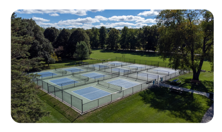
Ada Park - Pickleball Courts Capacity: 4 people/court