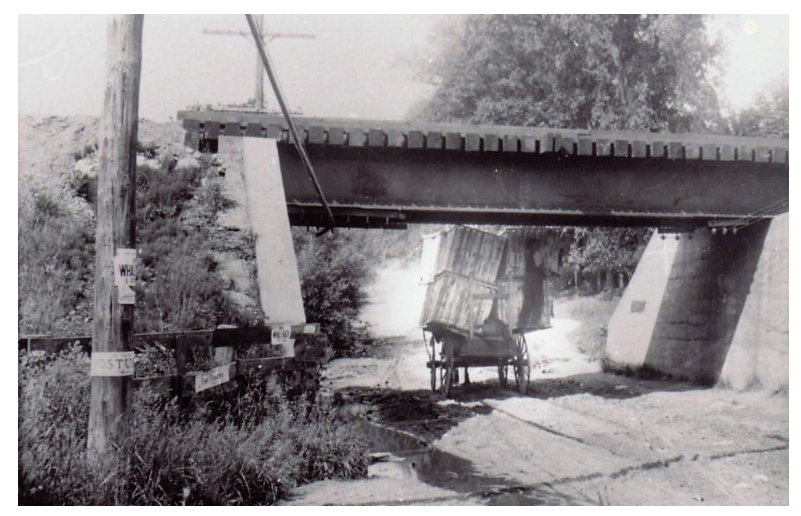
Caution – Low Clearance! This driver must have heaved a sigh of relief after barely clearing the railroad viaduct at Bronson Street. The horse-drawn wagon overloaded with crates will continue its climb up Ada Drive. Still a dirt road here about 1900, Ada Drive was then known as Main Street or Cascade Street.

11:00 am – 5:00 pm at the Averill Historical Museum and others. The Spring Into the Past small museums tour and open house will be May 5th and 6th. All museums in the Tri River group will be open that weekend and all will be FREE. The theme again this year is "Fashion Through the Ages." Pick up the 2018 museum booklet showing all other locations at the Ada museum.