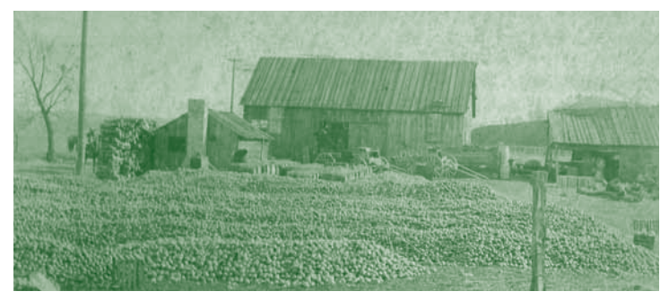
How Bout Them Apples? An early photo of the Niles Farm at apple harvest time. Note the ocean of apples piled in the farmyard. The Niles farm was located and also operated a cider mill near the present corner of Grand River and Fulton Streets.