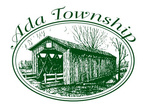
7330 Thornapple River Drive SE. P.O. Box 370 Ada, Michigan 49301