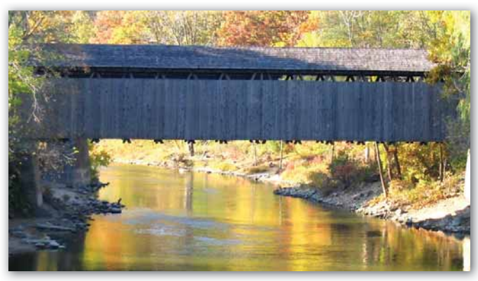
Leonard Field Park & Ada Covered Bridge 7490 Thornapple River Drive. 2 acres. Softball field, bike path, Thornapple River overlook.