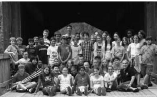
Students from N. Trails School at Ada Covered Bridge Earth Day '08

Service Learning Projects are available without a fee.