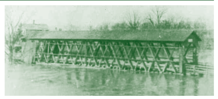
Deep and Wide. 1904 and 1905 also brought record flooding to Ada. The covered bridge was in danger of being swept away. Several measures were taken for its protection. Farmers parked wagons loaded with rocks on the bridge to weigh it down. The boards were removed from the sides to allow water to flow through the bridge. The bridge was even secured with a big cable to a nearby elm tree.

We partner with the Ada Parks Department for a fun and history-filled summer camp. The camp takes place at the museum, on the grounds, and in the barn onsite. Kids age 6-11 get to step back in time and live like the pioneers did! For details and to pre-register, please contact call (616) 676-0520 or email <a href="mailto:mfitzpatrick@adatownshipmi.com">mfitzpatrick@adatownshipmi.com</a>.