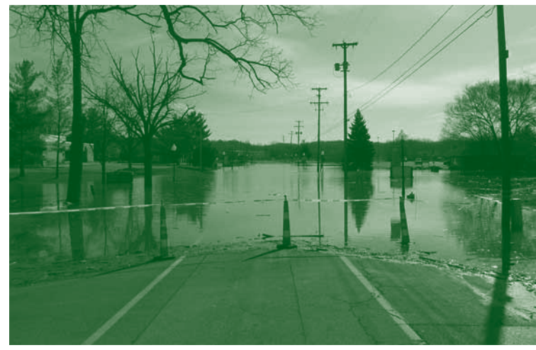
2013 Flood, Ada Dr. looking north toward Fulton St.

As we look back on the flooding in April that had us all in awe of the brute power of our rivers, we can put Ada's recent flood in some perspective. The peak water level of 22.94 feet that was recorded at the U.S. Geological Survey river gage in Ada was over 14 feet higher than the late winter river levels found in early March.