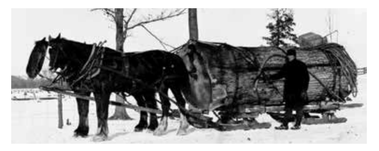
With all the forested hills in Ada township, lumber was a readily available resource in the early 1900s. This load c.1915 is Paul Bunyan sized!

Ho-ho-holy cow, it's the holidays already! The museum gift shop will be open 9 am- 4 pm highlighting Ada-themed items to help you fill Santa's bag. There will be cookies and hot chocolate in the barn beginning at 10:00 am before the Ada Santa Parade begins at 11:00 am.